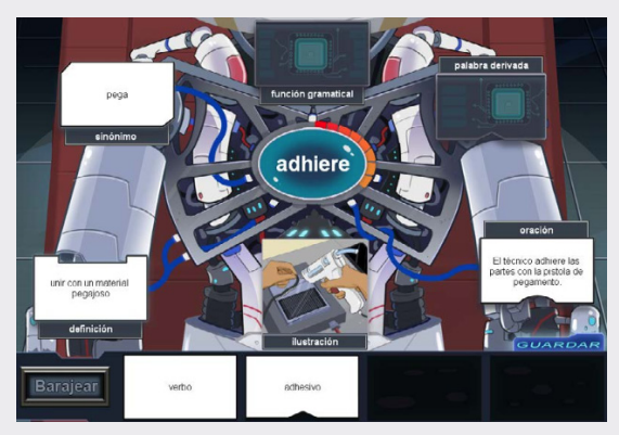
Engaging lessons and game-like activities