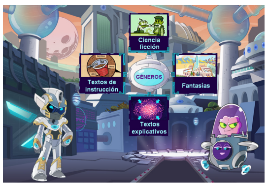
Instruction with Latin culture and literature

Aligned to individual state standards and Common Core State Standards, Istation's assessments, instruction, and teacher-directed lessons also support English-language instruction and special education.