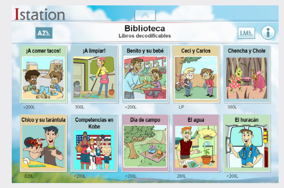
Interactive books based on each student's reading abilities

Schools get up-to-date Lexile reading measures for students based on their performance on Istation's Indicators of Progress (ISIP<sup>™</sup>) assessments. Interactive books and reading passages are correlated to Lexile reading measures. Searching beyond Istation's digital library of reading materials, the Lexile Find a Book feature screens and filters books according to Lexile measure along with genre, reading interest, and more.