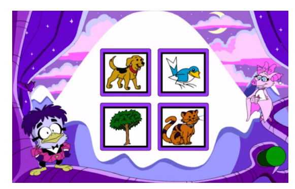
Computer-adaptive screeners and progress monitoring for early and advanced reading