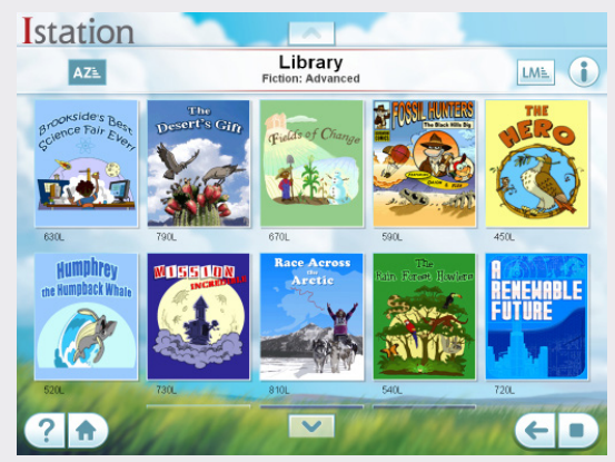
Interactive books based on each student's reading abilities

The types of errors that can be identified include self-correcting, word meaning, syntax and visual miscues.