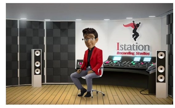
Digital Oral Reading Fluency assessment with speech recognition technology

Aligned to individual state standards and Common Core State Standards, Istation's assessments, instruction, and teacherdirected lessons also support English-language instruction and special education.